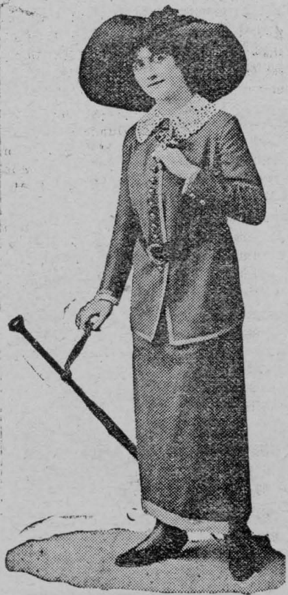
GIRL'S STUNNING SUIT.

Take, for instance, a new model in a dark blue serge skirt—that thin sum-