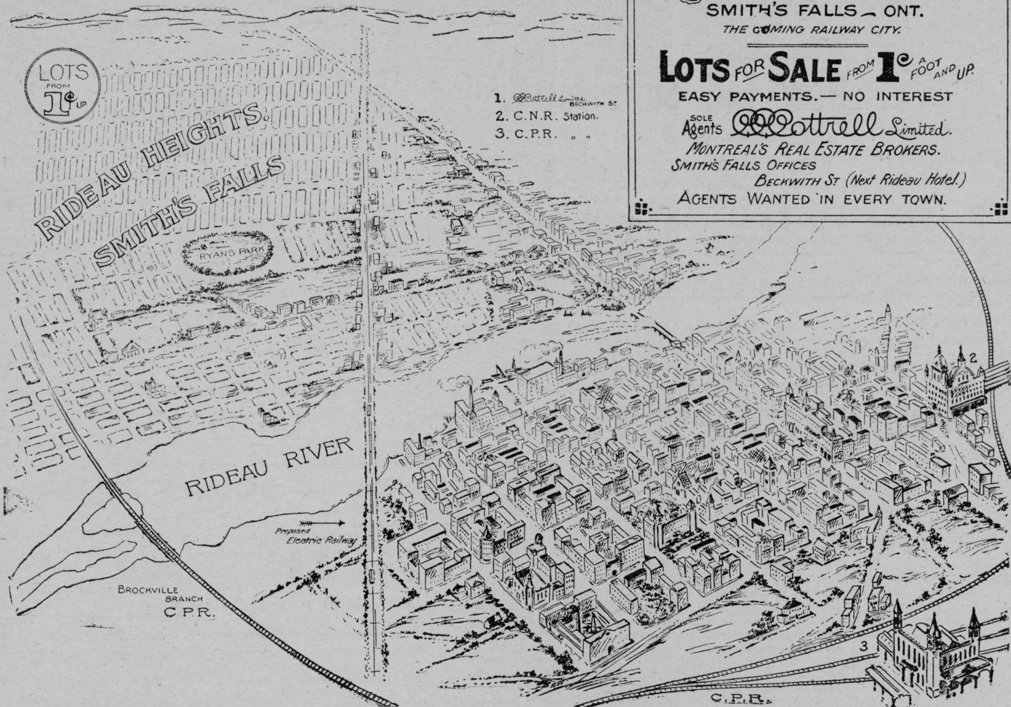
View of Smith's Falls, shortly to become a city, showing Rideau Heights only 9 minutes actual walk from the centre of the business district. Water, sewers, electric lights, houses and sidewalks right up to the property now.

The Montreal Real Estate Broker who saw an opportunity in Smith's Falls, the Railway Centre, and who is putting on this sub-division in his usual progressive up-to-date style. Where he fails none can succeed. The prices and terms alone would sell this property.