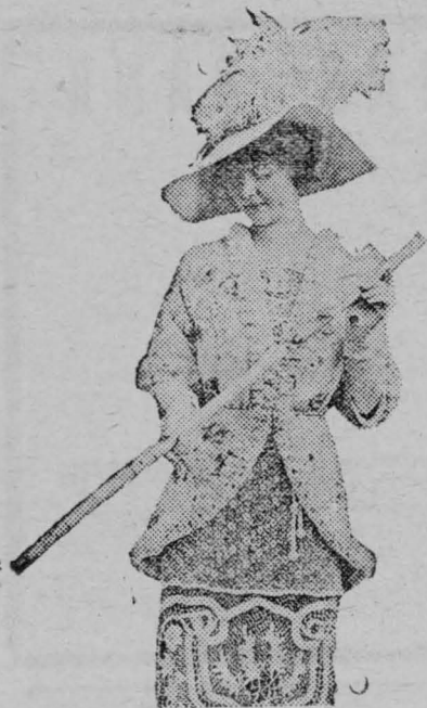
THE SPORTY SUMMER SUNSHADE.

The Telescope Parasol Correct Caper Nowadays.