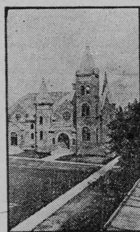
DEPARTMENT OF THE SUNDAY SCHOOL.

N.B.—The members of the Sunday School are requested to meet in the Lecture Hall at 10 a.m., Sunday morning. Seats will be reserved for the school.